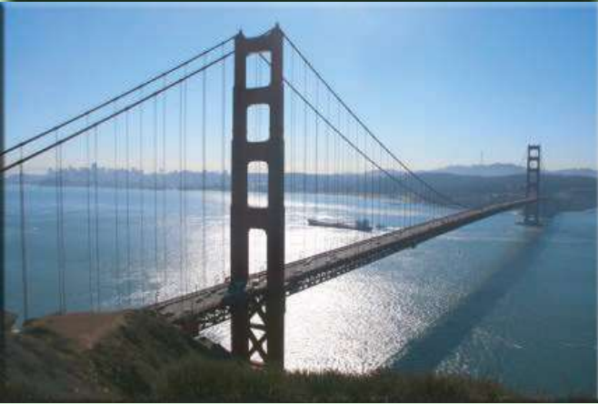
Golden Gate Bridge and San Francisco Skyline