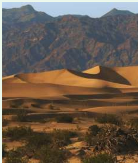
Death Valley National Park, Dunes

Day 14: Journey home or continued travel on your own.