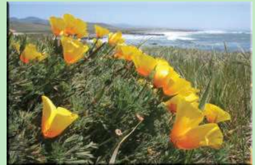
Big Sur coastline

Upbeat westcoast cities offer shopping, galleries, romantic harbors, Hollywood Star Walk, Universal Studios, Las Vegas casinos and shows, and more. In equal measure we immerse you in the West's most scenic natural areas-- vast expanses of protected land at Joshua Tree and Death Valley national parks, numerous state parks, and on the pristine Pacific coast. After a wild carnival ride or performance in L.A., spend an evening relaxing in a hot tub at one of our choice hotels. Or you may choose an optional whale watching tour, then capture a perfect picture of wildflowers on a beach where you can walk peacefully until the sun sets. Let us take you there. We'll worry about the details while you enjoy this amazing state.