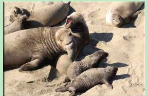
Elephant seals near San Simeon