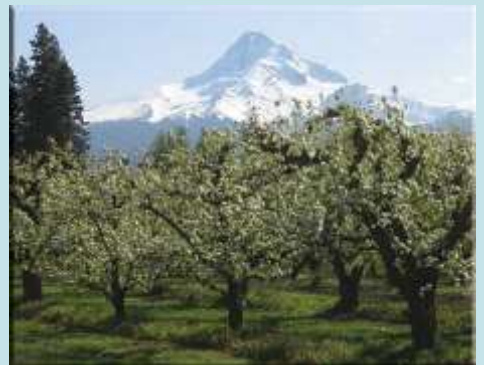
Mt.Hood and Orchard

Experience the Oregon coastline, from solitary golden sand beaches to crashing surf and coastal forests. Complete with a lighthouse tour, world-class aquarium and quality galleries, your coastal days will be a combination of relaxing and fun.