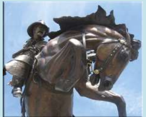
Wild West Cowboy, Joseph

A ring of volcanic activity extends through Oregon, and this tour gives you the opportunity to view some of the most impressive volcanoes in the area. Experience Crater Lake National Park, home of the deepest lake in North America. Stand high up on the rim of this ancient giant and look into the bright, crystal blue water. The Bend area lava lands presents a variety of interesting volcanic geology, including glassy obsidian and tree casts. Mount Hood offers a lovely snowcaped view and cozy historic lodge. A visit to this ski resort area offers a fantastic winter landscape in the midst of summer.