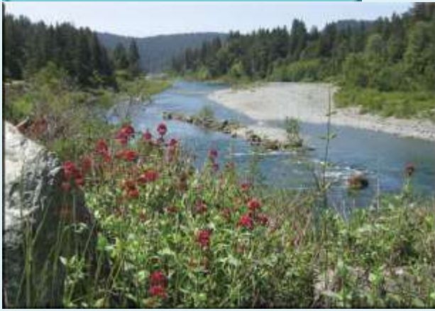
Smith River View