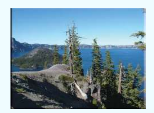
Crater Lake National Park, Oregon