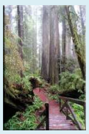
Trail through Redwoods, California