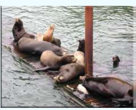
Harbor Seals, Oregon Pacific Coast