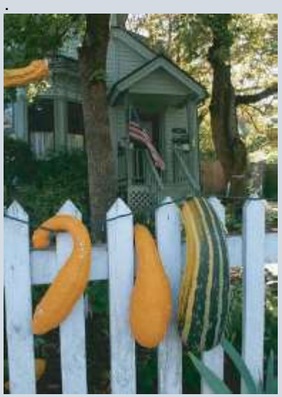
typical Jacksonville home

Day 15: Tour ends here , you are free to explore Seattle on your own or fly home.