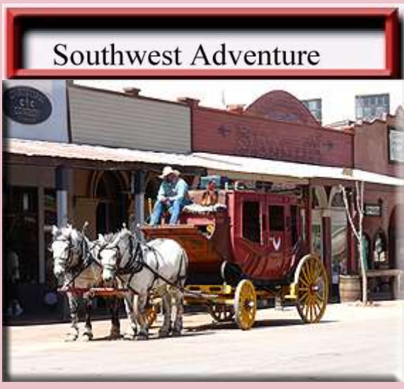
Explore Southwest nature, culture and history.