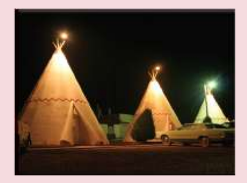
Wigwam Motel, Route 66