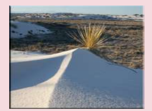
White Sands National Monument