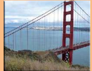
Golden Gate Bridge – San Francisco