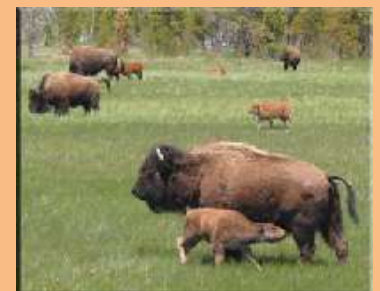
Yellowstone wild buffalo herd

Our Wild West Yellowstone Tour offers a wide variety of wildlife sightings throughout the western states. You will find yourself in the midst of buffalo and elk herds; you have an excellent chance of spotting a moose, black bear, or even a grizzly bear. Small, furry animals like prairie dogs, chipmunks and rabbits abound, and the diverse ecosystems are perfect for other wild animals and rare birds. This tour offers an unforgettable experience for wildlife- and outdoor lovers.