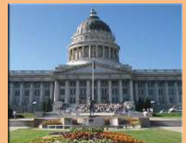
Salt Lake City, Capitol