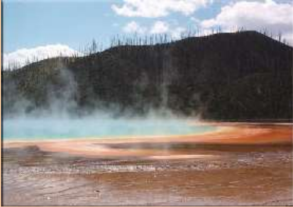
Yellowstone National Park