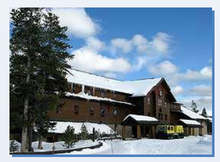
Old Faithful Lodge

Stay in cozy lodges and hotels while spending the days out and about exploring. Opportunities for wildlife viewing abound as animals come down from higher elevations to seek food. The winter wilderness of Utah, Idaho, Montana, and Wyoming is home to bear, bison, coyote, wolves, eagles and bighorn sheep.