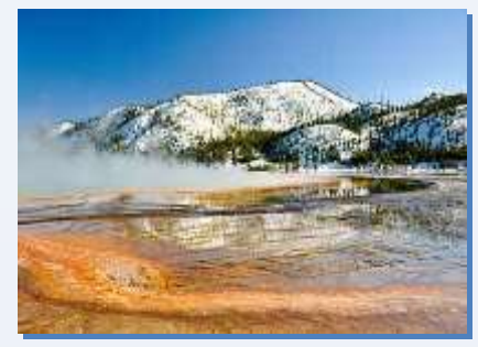
Midway Geyser Basin